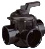
263026 • 3-way 2" x 2½" CPVC 263035 • 3-way 1½" x 2" CPVC

Pentair valves offer dependable, lubrication-free performance for less. Engineered for long life, they outperform other manufacturers' higher priced valves. Ask your sales representative for pricing.