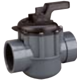
263029 • 2-way 2" x 2½" PVC 263038 • 2-way 1½" x 2" PVC