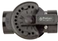
263027 • 2-way 2" x 2½" CPVC 263036 • 2-way 1½" x 2" CPVC