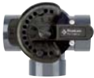
263028 • 3-way 2" x 2½" PVC 263037 • 3-way 1½" x 2" PVC