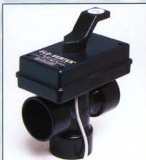
Unique Unibody Construction