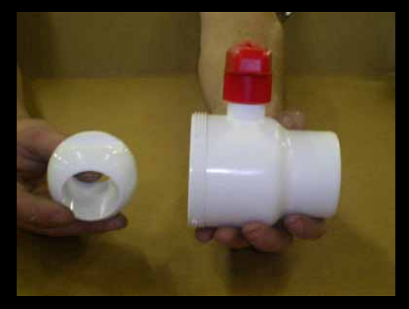
STEP 9: REMOVE THE SECOND BALL SEAT LOCATED INSIDE THE VALVE BODY.